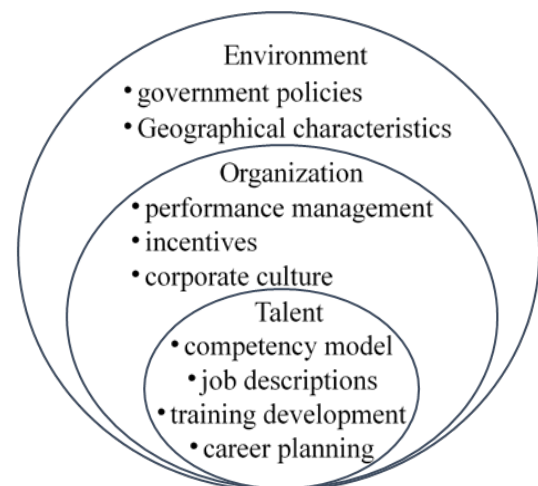
Figure. 2 Enterprise Three-Tier Talent Ecosystem

The quantity and quality of talents, especially science and technology talents, are related to the technological independent innovation capability in a region. It is related to the revitalization of industries and to regional economic and social development. The construction of innovation and entrepreneurship ecological environment is conducive to promote the development of the real economy, technological innovation, modern finance, and human resources [10]. The sense of well-being and security development promotes the construction of a harmonious society and the sustainable development of regional economic development.